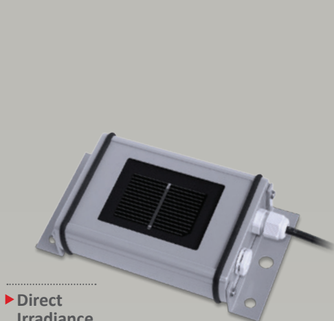
▶ Direct Irradiance sensor

SE1000-SEN-IRR-S1 / SE1000-SEN-TAMB-S2 SE1000-SEN-TMOD-S2 / SE1000-SEN-WIND-S1