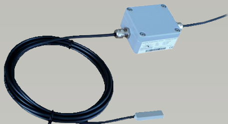
▶ Module Temperature sensor