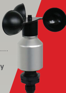
▶ Wind Velocity sensor